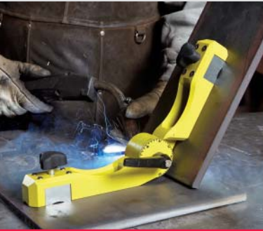
Pivot range for angles from 22 to 270 degrees.