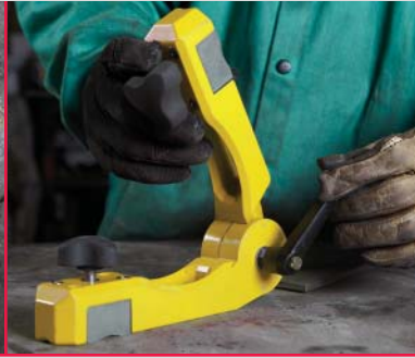
Single lock on elbow for fast securing of your angle.