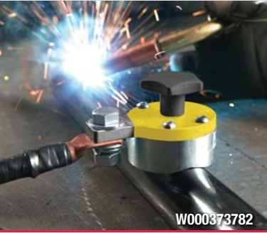
Strong grip on flat or round surfaces.