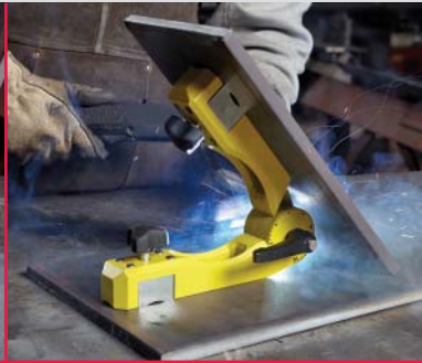
Each axis magnet holds on two sides.

MAGSWITCH Pivot Angle offers a range of angles from 22 to 270 degrees. Each axis features a MAGSWITCH with a 200 lb (90 kg) holding capability. A single pivot point is located on the elbow. The elbow joint locks and unlocks quickly with a lever. The dial on the elbow features indicators every 5 degrees. On each axis MAGSWITCH is exposed on a side to enable the tool to secure to a table or wall, while simultaneously holding the work piece. Perfect for repetitive work on uncommon angles.