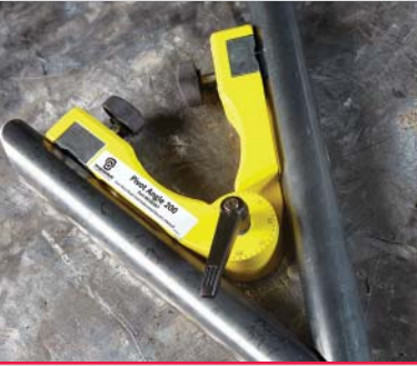
Accommodates flat and pipe.